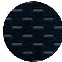
Black Sports Fabric Geometric Print Trim GTS