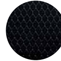
Black Premium Sports Fabric Geometric Print Trim RALLIART