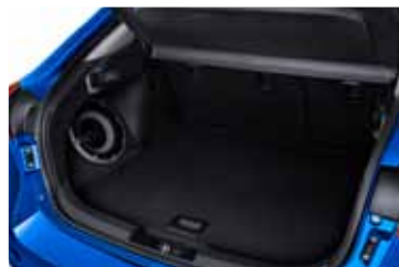
Up to 52.7 Cubic Feet of Cargo Space