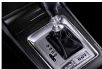
RALLIART with TC-SST and AWC