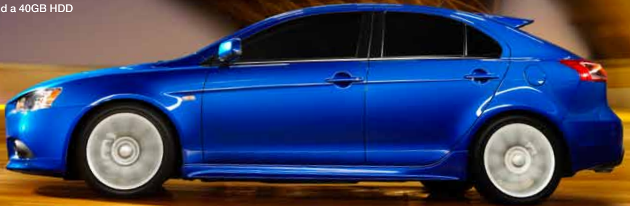
Lancer Sportback RALLIART in Octane Blue

Beyond its spacious cargo hold and sporty European influenced styling, the Lancer Sportback offers all the great performance and safety features its respected family is known for. That means available TC-SST, AWC, seven standard airbags 1 and a 40GB HDD navi/music server, for unlimited fun on the road.