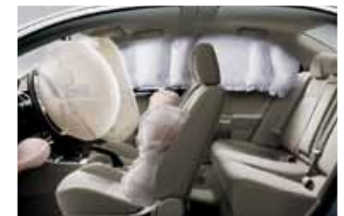
Seven Standard Airbags