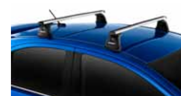
Roof Rack Kit