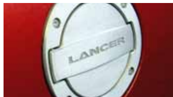
Alloy Fuel Door