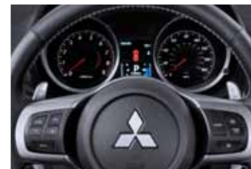
Full-Color Multi-Information Display