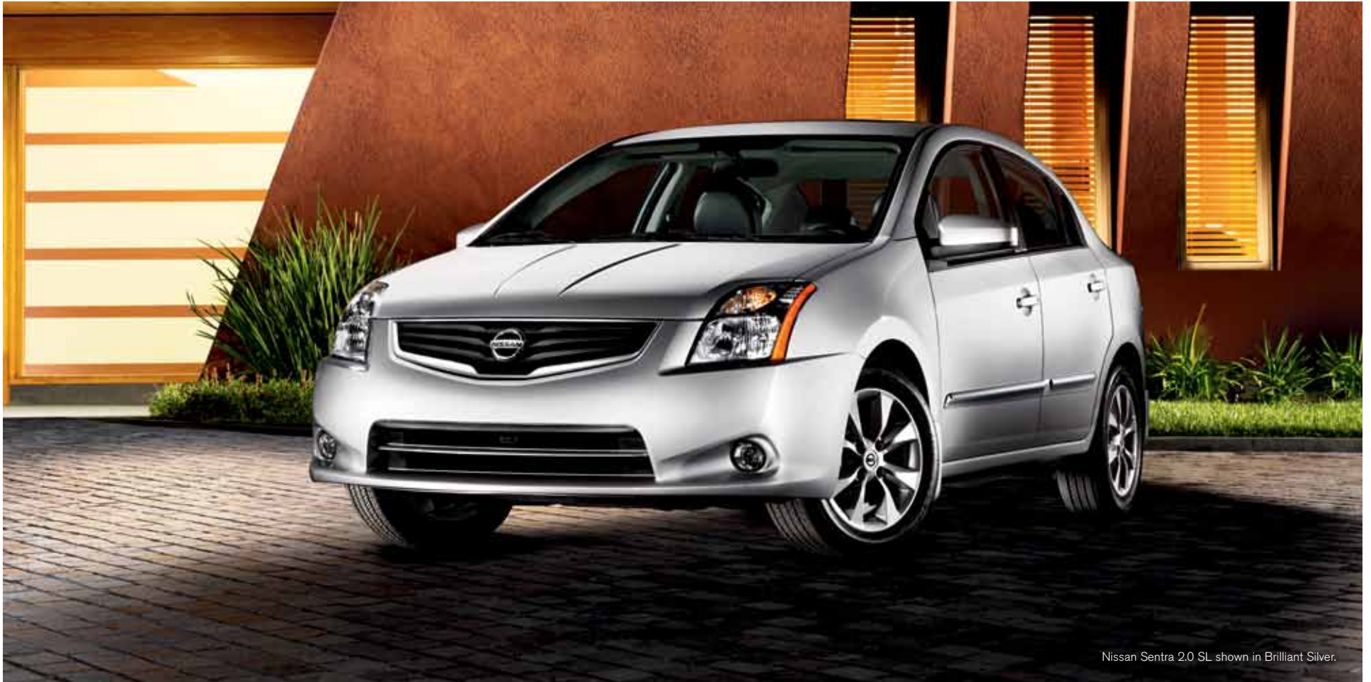
Nissan Sentra 2.0 SL shown in Brilliant Silver.